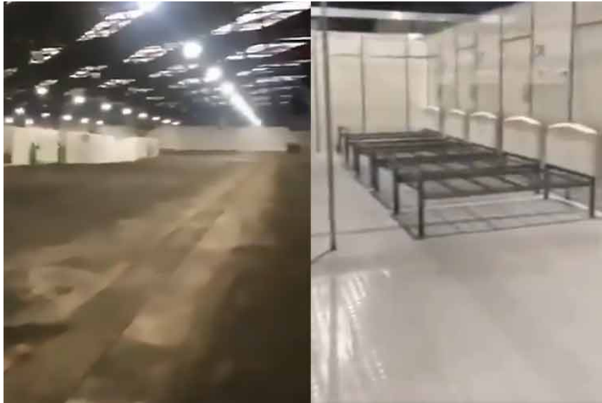
In São Paulo, the Anhembi Action Hospital was also unexpectedly checked. The whole building turned out to be largely empty as well (see picture above). (12C)