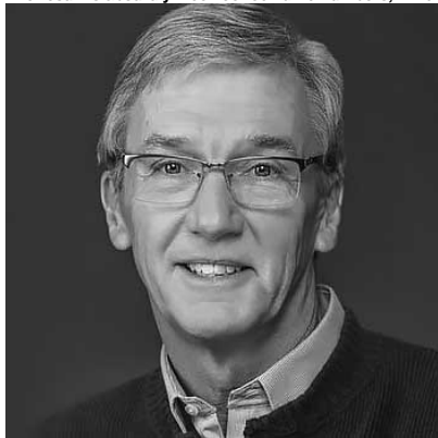
'Hospitals get big money for every covid-19 registration. No testing required. The result is massive fraud with covid-numbers.' DR SCOTT JENSEN, SENATOR MINNESOTA

The result is absurdly incorrect covid-19 numbers, which are spread nationwide by the media (12).