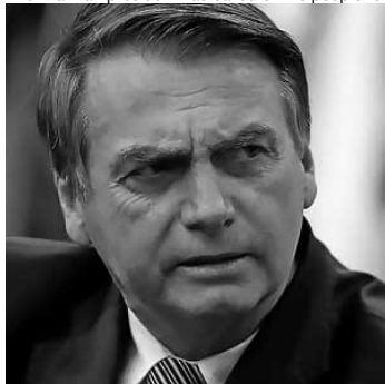
'The people will soon see that they were tricked by these governors and by most of the media when it comes to the coronavirus.' Jair Bolsonaro, President of Brazil

The Brazilian president has called on his people to film the hospitals and expose this large-scale deception. In an interview he stated: (12D)