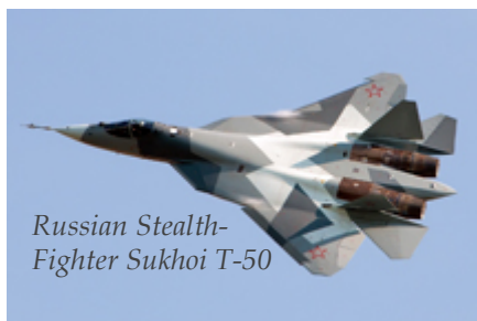
Russian Stealth-Fighter Sukhoi T-50

We have noticed that, also in defiance of Our advice, over the last twenty years, more and more Gibraltarians are speaking Spanish, in preference to English. What message does that send to Madrid? That they are winning! Like I said, what common-sense can you expect in a lunatic asylum?