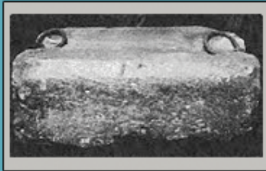
Real Stone of Destiny Made of Porphyry Stone Weight is 458 lbs