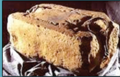
Fake Stone of Destiny Made of Scottish Sandstone Weight is 336 lbs